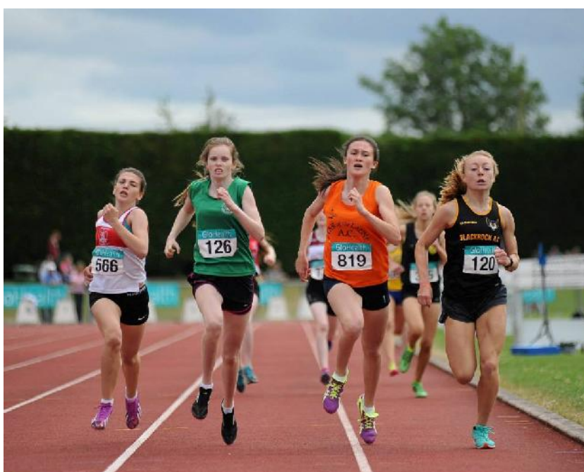
4 July 2015: Several sides of the action during the 1500m during the Galballyn Decade Track and Field Championships, Fanahan McSweeney, Co. Offaly.